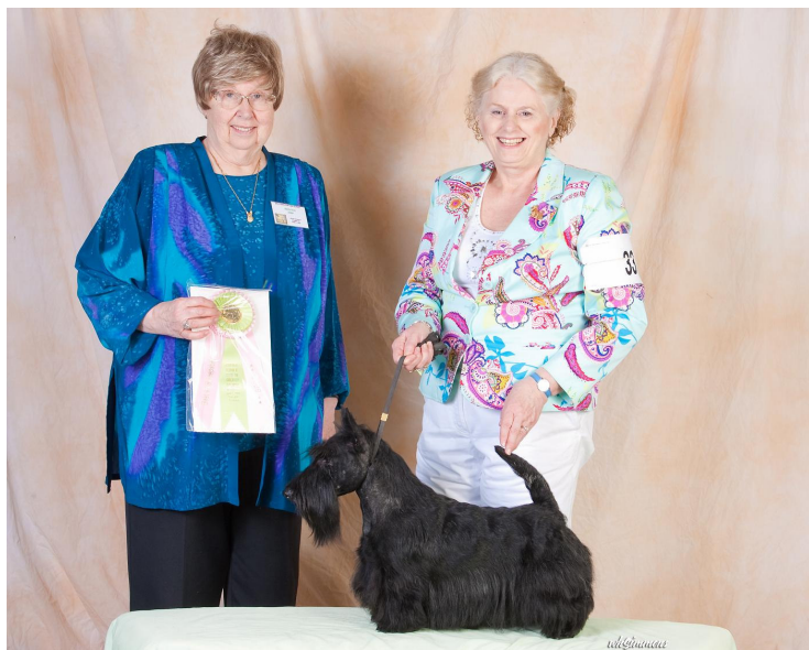
Charhill Spot Light

Scottish Terrier Club of America National Speciality: Reserve Winners Bitch: Charhill Midnight Silver