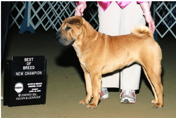
Ch. Kudzu An American Rose