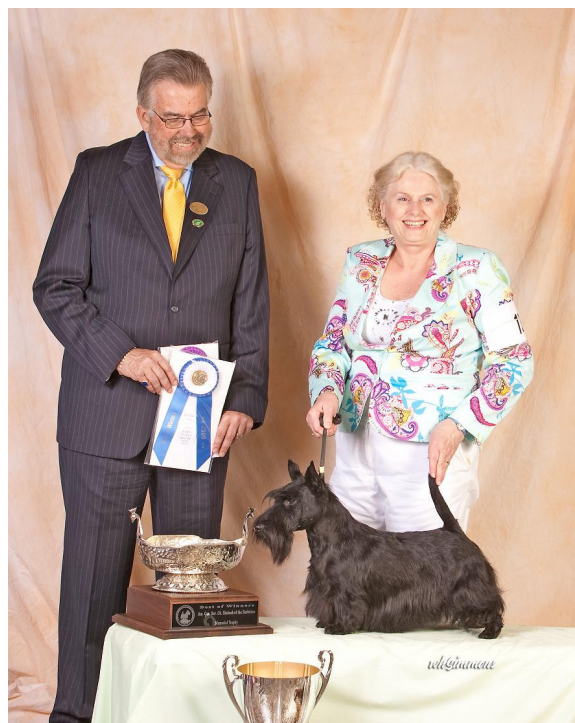
Charhill Play for Keeps II