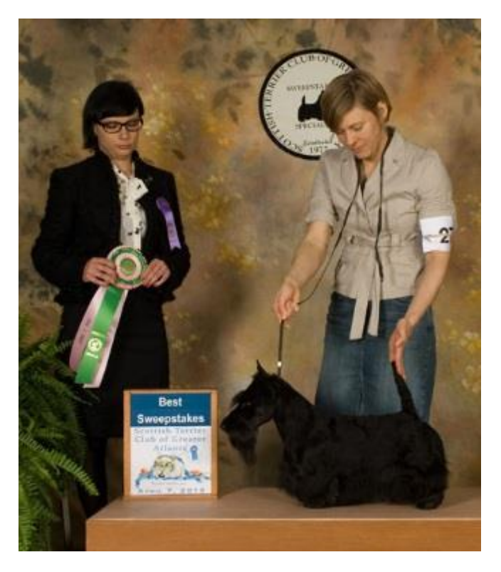
Charthill Roman Empire