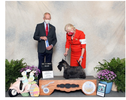
Charthill Starshine with Morejoy (Luna) finished her <u>championship</u> in Lawrenceville

Charthill Lucy in the Stars Morejoy (Lucy) finished her <u>championship</u> at the Hendersonville Shows